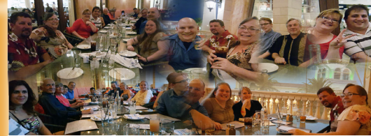
NEVADA, 7/30, Echo & Rig Steakhouse