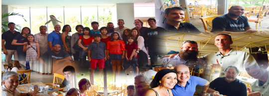
OKINAWA, JAPAN, 8/15, Onna Village