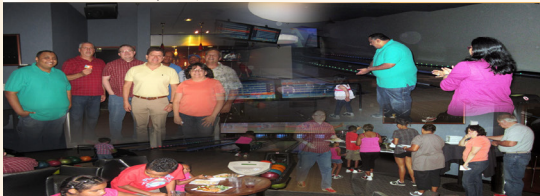
NEW YORK, 7/25, Bowlmor Lanes