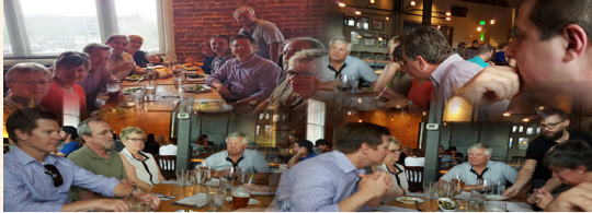
COLORADO, 7/28, Euclid Hall Bar & Kitchen