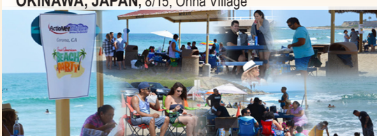
CALIFORNIA, 8/22, San Onofre Beach Club