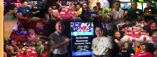
HAWAII, 8/15, Dave & Busters