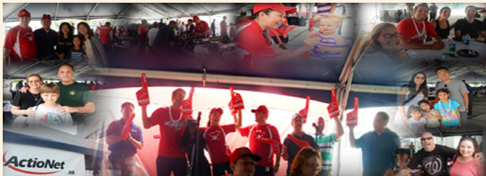
WASHINGTON, DC, 7/18, Nationals Park