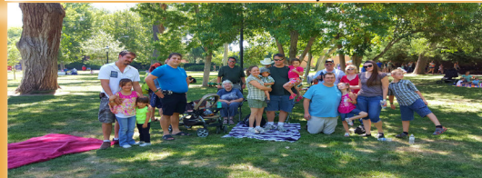
NEW MEXICO, 7/25, Albuquerque BioPark Zoo